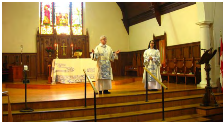
The Dismissal: the other clergy, servers and choir have processed to the back of the church and the hymn has ended. The deacon and sub-deacon remain in the chancel, where the deacon gives the Dismissal.

The closing hymn comes next, with procession of the ministers and choir (if present). The Dismissal may come before the hymn or may follow it as the last act of the service. Ormonde Plater says that if a hymn precedes the Dismissal, “with all the liturgical ministers retiring to the front door, the deacon should still remain in front of the people or return to the front to give the dismissal.” 167 The Book of Alternative Services provides four recommended options for the Dismissal. The deacon may add brief introductory phrases for special occasions. During the fifty days of Easter, the deacon adds “alleluia, alleluia!” Note that the Dismissal may be sung; tones are found in the Book of Alternative Services (p. 924) and Ormonde Plater’s Music and Deacons (p. 20).