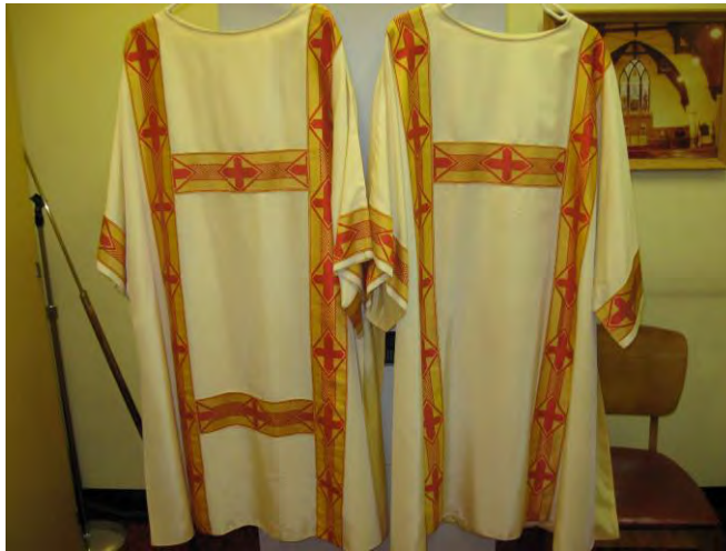
Traditional vestments: the deacon’s dalmatic (left) has two horizontal stripes; the sub-deacon’s tunicle (right) has one.

The dalmatic is “an ancient vestment associated with a servant” 181 and “appears to have originated as a garment of ordinary dress in the province of Dalmatia, being made from the fine wool for which the province was noted.” 182 Its use as an ecclesiastical vestment seems to have become general by the fifth century in Rome, where it was worn by both bishops and deacons. Eventually the custom of the deacon wearing the dalmatic spread across the western church. (The Roman rite still provides formally for bishops to wear the dalmatic under the chasuble at such occasions as ordinations.) Originally dalmatics were decorated with two vertical stripes on either side reaching from top to bottom, front and back, and with two circular stripes on the sleeves. Although this pattern is still found, dalmatics evolved like other vestments and were decorated in a variety of ways. In the traditional “high mass,” the deacon wore a dalmatic with two horizontal stripes, while the sub-deacon wore a very similar garment, the tunicle , differentiated from the dalmatic by having only one stripe – a practice still followed in some parishes.