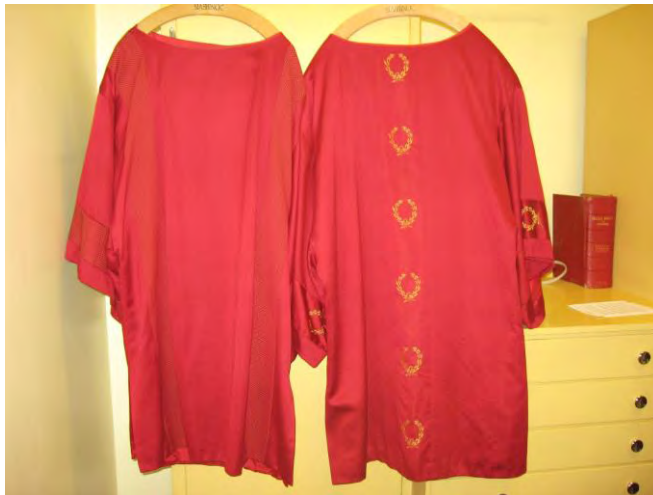
Contemporary vestments at St. Paul’s Cathedral, Regina: the deacon’s dalmatic (right) has more ornamentation than the sub-deacon’s tunicle (left).