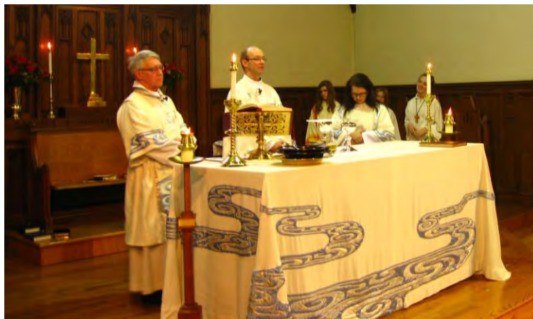
The Great Thanksgiving: the deacon stands on the presiding celebrant’s right and the sub-deacon on his left. Note that the altar book is on the celebrant’s right.