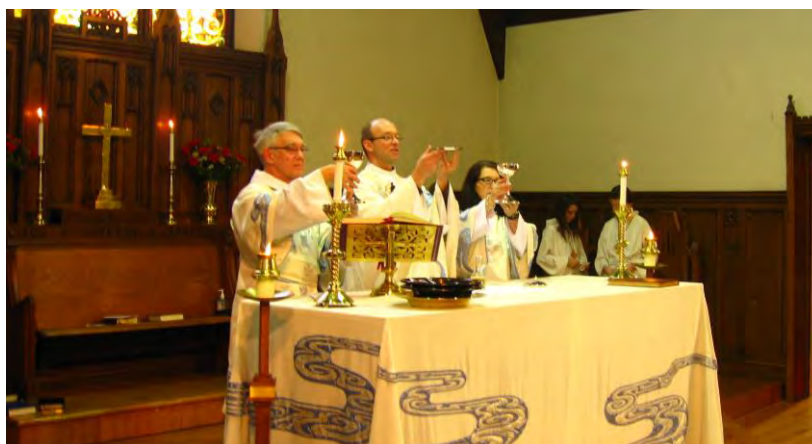
The Invitation to Communion: the deacon raises the chalice, the celebrant the paten, and the sub-deacon the ciborium.

After the Sanctus and Benedictus , at St. Paul’s the deacon removes the pall from the chalice and stopper from the wine cruet, while the sub-deacon removes the lid from the ciborium (this is not essential, and parishes will adapt their own practices to the vessels they are using and the people at the altar). During the eucharistic prayer, the deacon makes a profound bow at the words of institution of the bread and the wine. According to the presider’s preference, the deacon may raise the chalice at the final doxology while the priest raises the bread. During the Our Father (said or sung), it is customary in many churches for the ministers at the altar to extend their hands, palms upwards, in the traditional gesture of prayer ( orans ). After the breaking of the bread and the accompanying sentences, the presider gives the invitation to communion, “The gifts of God for the People of God;” at this point the deacon raises the chalice while the priest raises the bread.