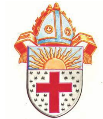
Diocese of Qu'Appelle