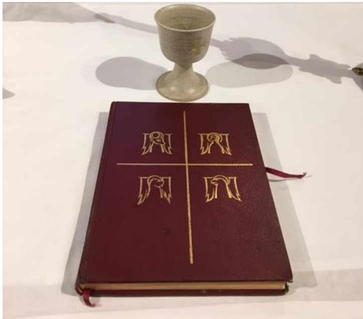
Word and Sacrament are integral parts of the deacon’s ministry, as symbolized by the Book of Gospels and the ciborium for the bread of Holy Communion.

The first is liturgical, sacramental . It is essential that deacons fulfil, and be clearly seen to fulfil, their liturgical roles, especially at the Eucharist: proclaiming the Gospel; sometimes leading the Prayers of the People and the confession; inviting the people to share the peace; preparing the table; administering communion; and giving the Dismissal. The proclamation of the Gospel is the high point of the ministry of the Word and of the deacon’s role in the Eucharist.