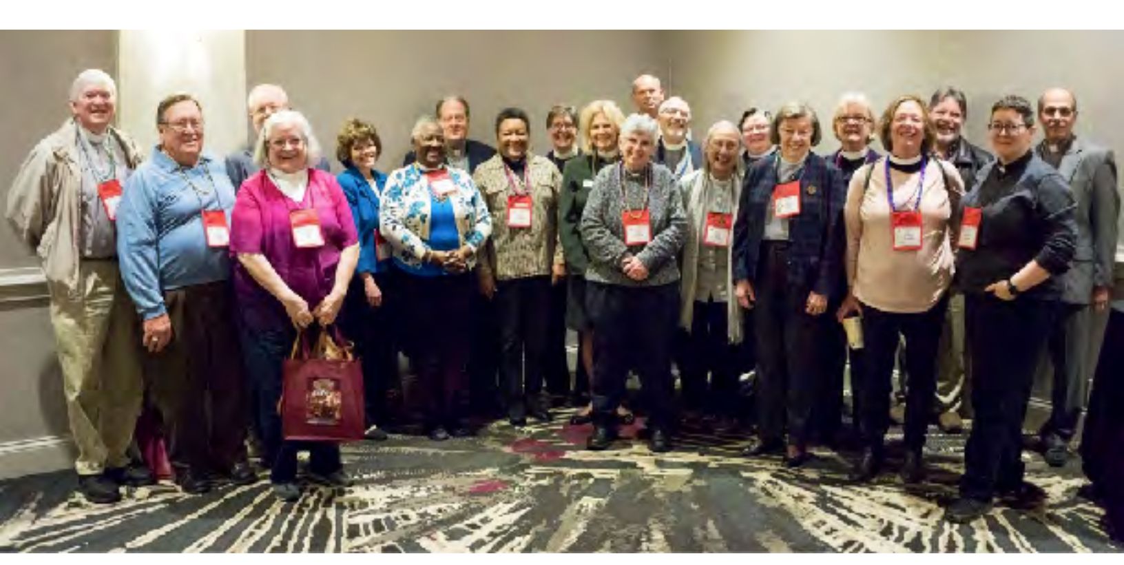
Community of Deacons at the 187th Priocesan Convention, February 2018.