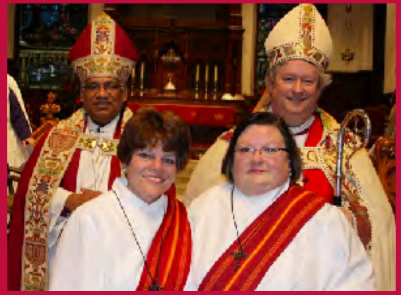
Third Class (2) ordained November 3, 2012