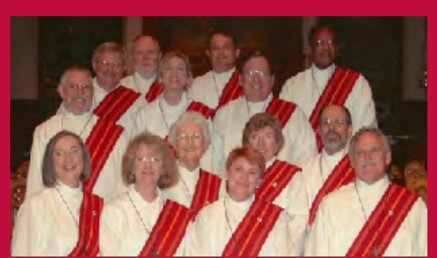
Second Class ordained October 30, 2004