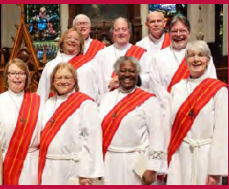
Fourth Class ordained October 1, 2016 July 2018