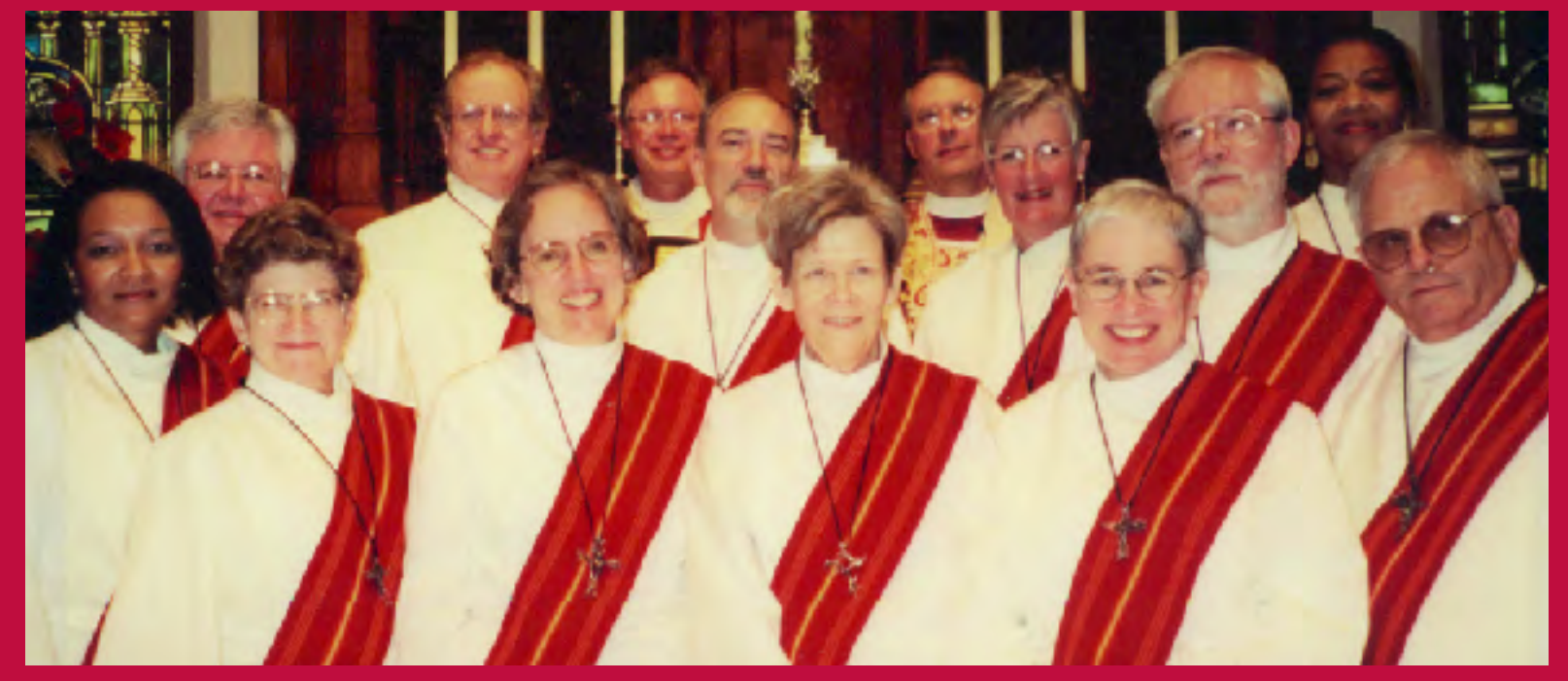
First Class ordained November 2, 2002