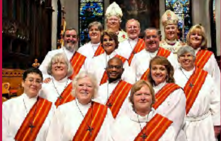
Third Class (1) ordained October 1, 2011